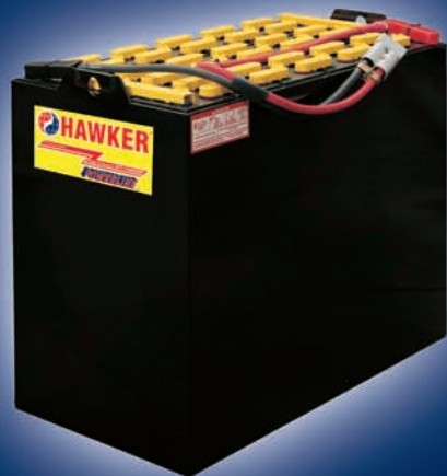
POWERLINE™ - Full-Shift Power Source

Let's take a closer look at the POWERLINE™ battery's construction and added benefits: